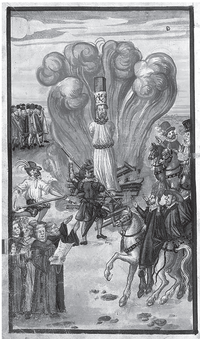
Fig. 8 The Burning of Jan Hus (1587) Kancionál: MS Prague NK I A 15, f. 305v