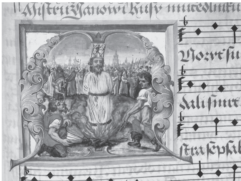
Fig. 5 The Burning of Jan Hus (1566) Teplice Kancionál: Regional Museum, Teplice MS 2