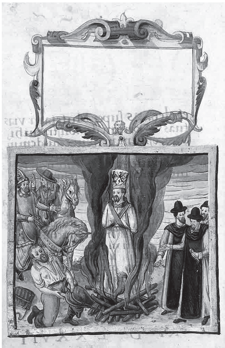
Fig. 7 The Burning of Jan Hus (1577-8) Opatovice Gradual: MS Prague XI B 1a, f. 362v